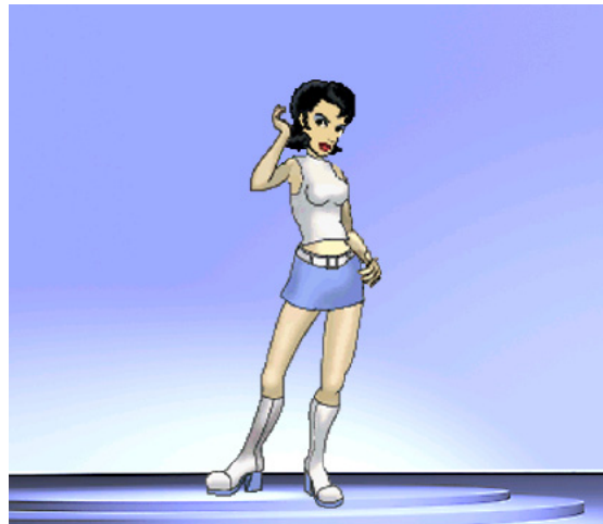
Figure 1. The presentation agent Cyberella.

computer dialogue more like human-human dialogue. Computers are ever less viewed as tools and ever more as partners or assistants to whom tasks may be delegated. Trying to imitate the skills of human presenters, some R&D projects have begun to deploy animated agents (or characters) in wide range of different application areas including e-Commerce, entertainment, personal assistants, training / electronic learning environments [4, 9]. Based either on cartoon drawings, recorded video images of persons, or 3D body models, such agents provide a promising option for interface development as they allow us to draw on communication and interaction styles with which humans are already familiar.