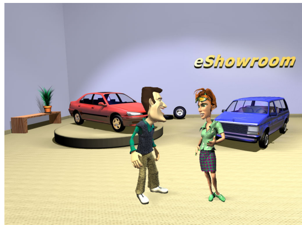
Figure 2. The agents Tina and Ritchie engaging in a car sales dialogue in the IMP.

From the point of view of the system, the presentation goal is to provide the user with facts about a certain car. However, the presentation is neither just a mere enumeration of the plain facts about the car, nor does it assume a fixed course of the dialogue between the involved agents. Rather, IMP supports the concept of adaptivity. It allows the user to specify prior to a presentation (a) the agents' role, (b) their attitude towards the product (in our case a car), (c) their initial status, (d) their personality profile and (d) their interests. Taking into account these settings, a variety of different sales dialogues can be generated for one and the same product.