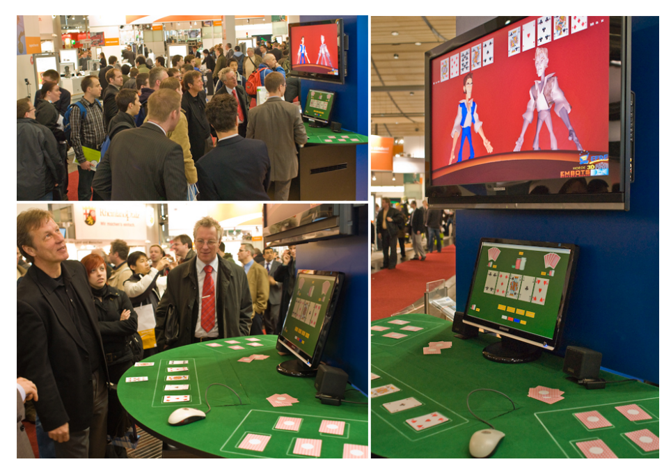
Fig. 1. Poker Demonstrator at the CeBIT 2008 fair

As shown in Fig. 1, we use a poker table which shows three areas for poker cards: one for the user and one for each virtual character. These areas of the table are instrumented with RFID sensor hardware, so that the game logic can detect which card is actually placed at each specific position. A screen at the back of the poker table displays an interface which allows users to select their actions during the game, using a computer mouse. These include general actions, such as playing or quitting a game, and poker game actions: bet a certain amount of money, call, raise, or fold. This screen also shows the content relevant for the poker game: the face of the user's cards, the number of Sam's and Max's cards respectively, all bets, and the actual money pot. The two virtual characters are shown above this interaction screen on a second 42" monitor.